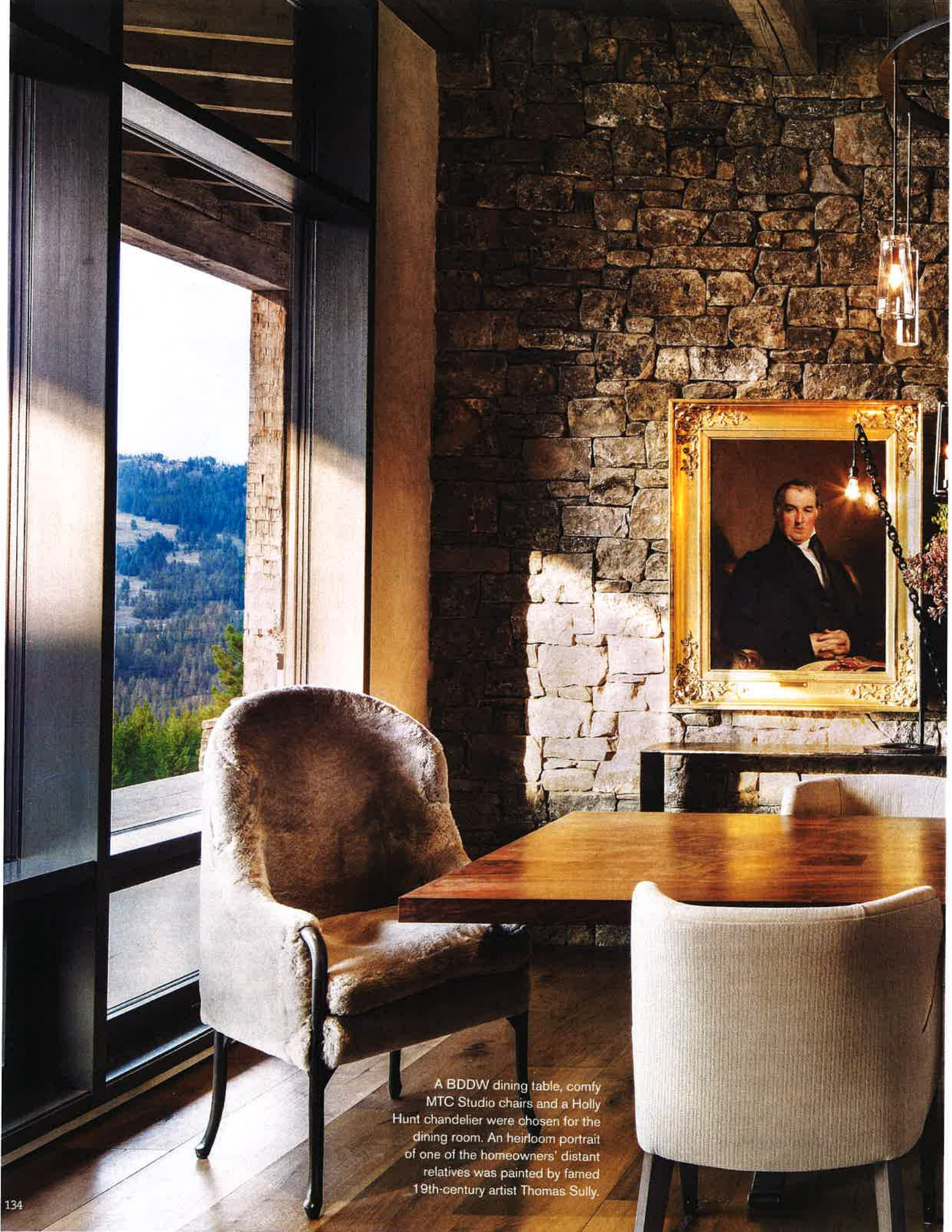
A BDDW dining table, comfy MTC Studio chairs and a Holly Hunt chandelier were chosen for the dining room. An heirloom portrait of one of the homeowners' distant relatives was painted by famed 19th-century artist Thomas Sully.