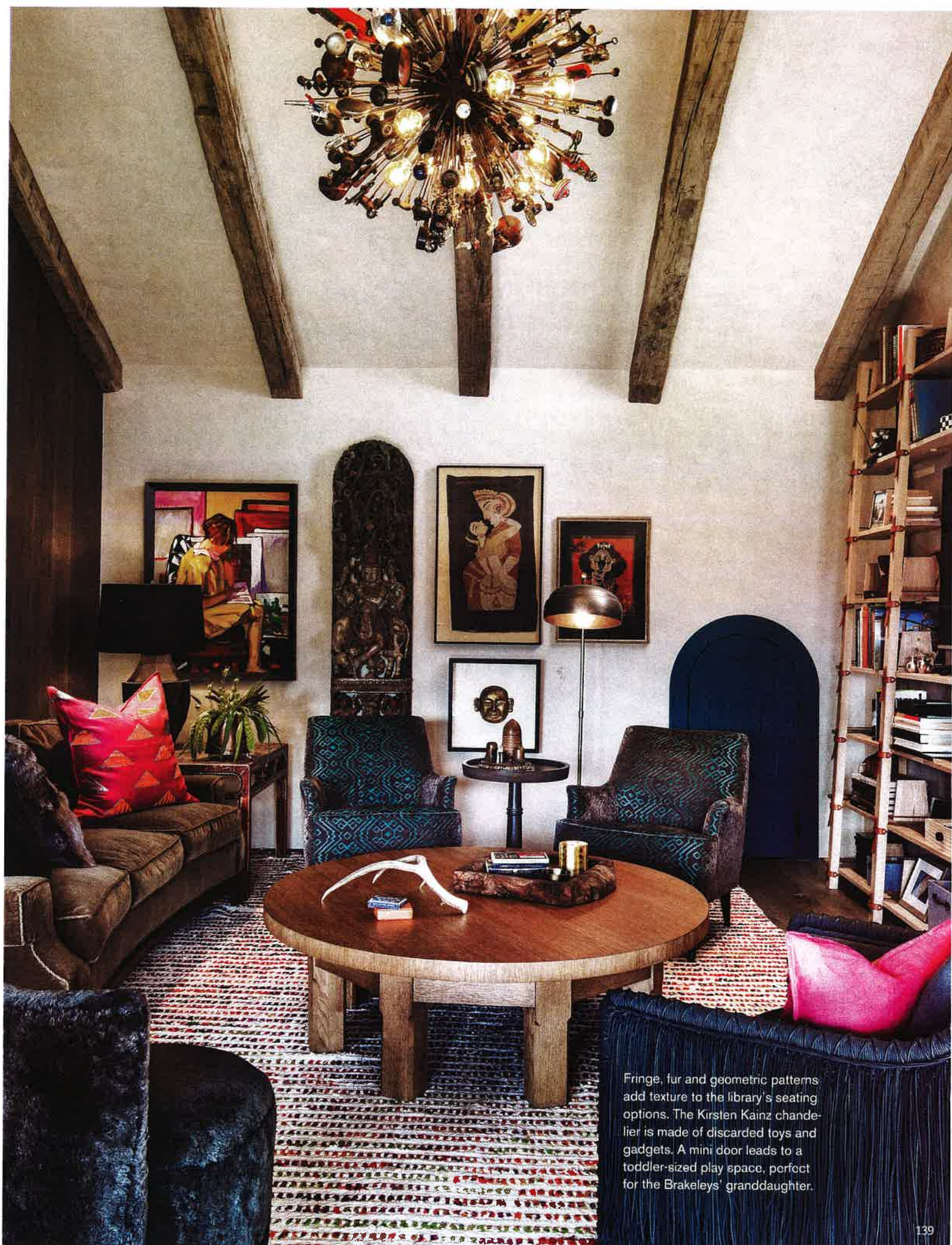
Fringe, fur and geometric patterns add texture to the library's seating options. The Kirsten Kainz chandelier is made of discarded toys and gadgets. A mini door leads to a toddler-sized play space, perfect for the Brakeleys' granddaughter.